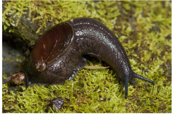
The rarely seen native paua slug