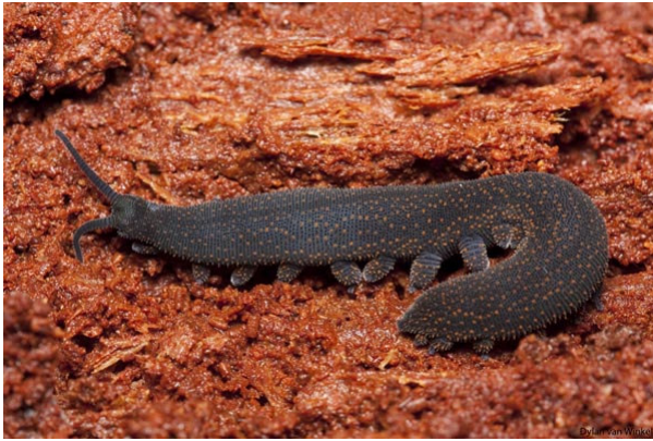
Magnified photo of velvet worm