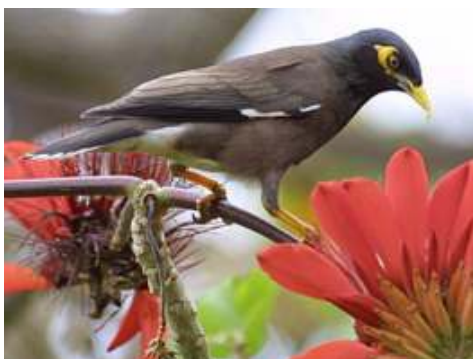
Fig 17.6. Myna ( Acridotheres tristis ) in a flame tree.

Another important feature, not evident from the bare figures in Tables 17.1 and 17.2, is that we have very little idea of the status of species populations in many groups. The organism may have been collected, but we have no idea how many there are, nor where they are situated, so we cannot judge whether they are endangered species or not. Again, judging from the information available from the better-known groups, it seems likely that a significant proportion (> 10%) are endangered. With the recently collected groups (such as the insects) we know that the collection does not adequately reflect the diversity, because specialised collecting techniques are needed for some types. It seems safe to say that, for the terrestrial and freshwater invertebrates, the freshwater algae, and the fungi, the numbers recorded represent only the tip of the iceberg.