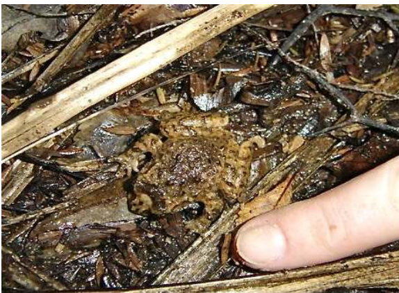
Fig 11.2 Hochstetter’s frog,

Hochstetter's frogs are semi aquatic, inhabiting stream verges and seepage areas in forested areas, where they form small localised populations. Goats, now eliminated from Great Barrier Island, have been recognized as a serious risk to Hochstetter’s frog through causing soil erosion and stream-side siltation. Pigs are likely to be even worse in this respect. The species is classified as ‘sparse’ ix and as ‘at risk’ in the IUCN x Red Data Book.